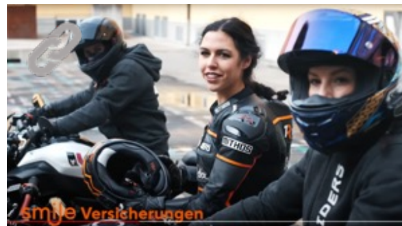
TV Spot, Smile Ensurances