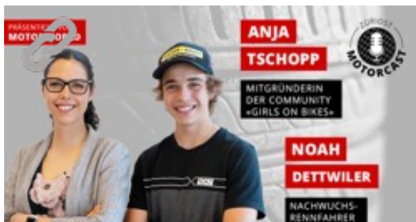
Next Generation Talk – Züriost